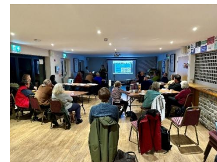
South East Somerset

The South East LCN area utilised the LCN network to promote the use of localised community flood warning systems such as the PegelAlarm, which was upgraded through grant funding and alerts users to water level activity at telltale sites equipped with monitoring gauges, enabling early flood preparedness and greater resilience to flooding. A Section 19 Flood Investigation report will be used by the LCN's flood working group to identify further opportunities for locally led change that mitigates risk to community members from potential flood events.