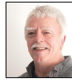
Tony Robbins Wells & Rural